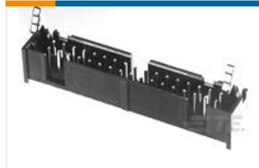
TE Part #2-1761608-5 IDC LOW PRO HDR 14P VERT SHT L