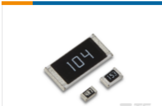
TE Part #3-2176337-4 CRGCO 0402 5K6 1%