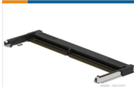
TE Part #2309408-1 DDR4 SODIMM 260P 4.0H RVS