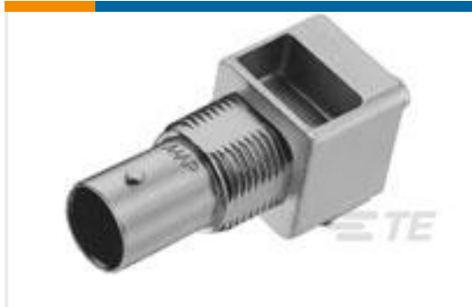
TE Part #5414907-1 JACK,PCB,75 OHM,NC