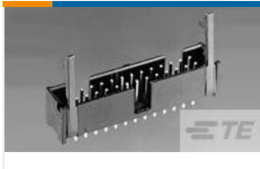
TE Part #1761609-7 IDC LOW PRO HDR 20P RA SHT LAT