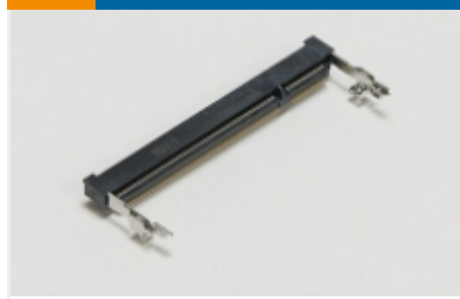
SO DIMM Sockets(39)