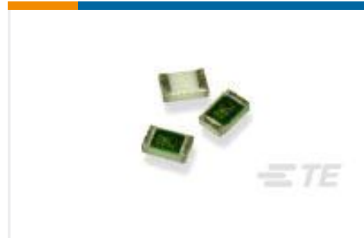
TE Part #1879417-3 CPF0603 620K 0.1% 25PPM 5K RL