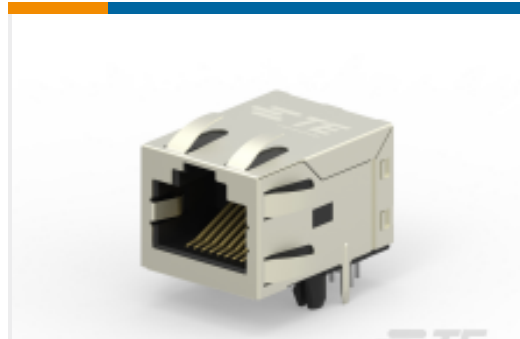
TE Part #2301994-5 RJ45 JACK INT.MAG. 1GB 1X1 INV.